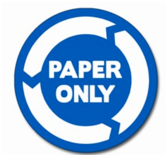
6" diameter sticker dark blue on white

See awarenessideas.com for more examples to help your sustainability program