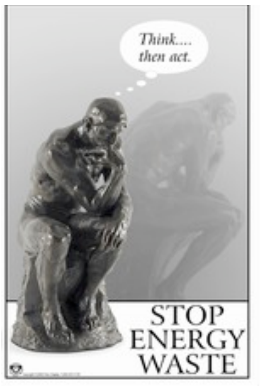
12" x 18" poster from awarenessideas.com