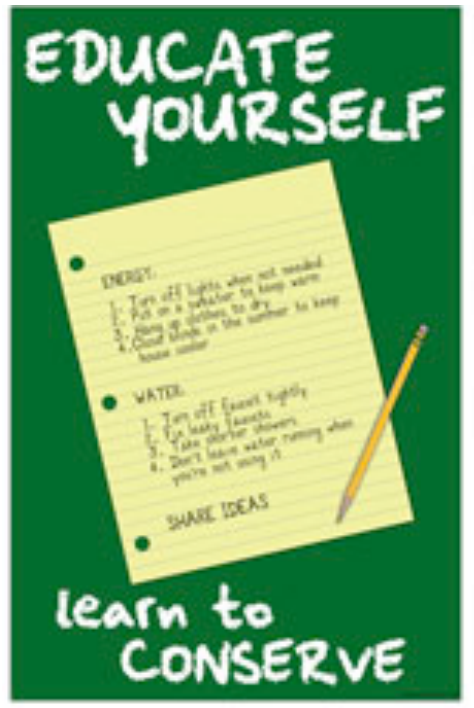
12" x 18" poster from awarenessideas.com

Most industries have created an “insider’s jargon.” The people involved in conservation have borrowed terms and acronyms from several different types of businesses. This section defines the most often used ones.