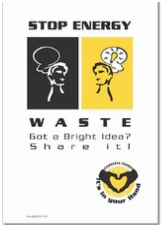
12"x18" poster from awarenessideas.com