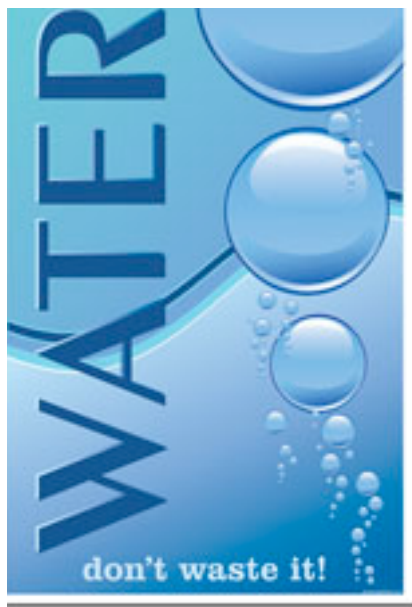
12" x 18" poster from awarenessideas.com