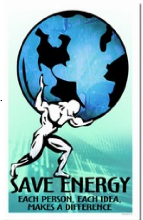
12" x 18" poster two tone blue